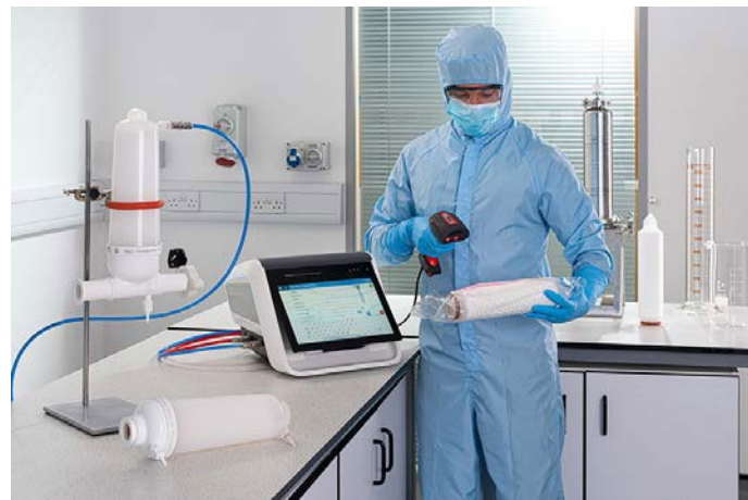
Fig 8. Bar code reader simplifies data entry and reduces operator input errors.

(1) For all marked software products, orders are required to mention the serial number of the Palltronic Flowstar V instrument for Cytiva to generate a complimentary license key for the software.