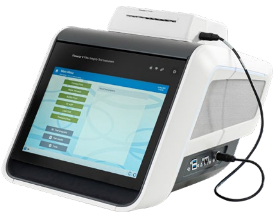
Fig 7. Thermal printer installed on the top of the Palltronic Flowstar V instrument.