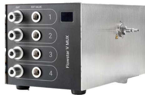
Fig 5. Palltronic Flowstar V MUX instrument.

The Palltronic Flowstar V MUX instrument connects to the Palltronic Flowstar V integrity test instrument (1) and allows a user to test up to 16 separate filter cartridges or capsules sequentially, reducing the need for a user to be present at frequent intervals to connect and disconnect filters to be tested.