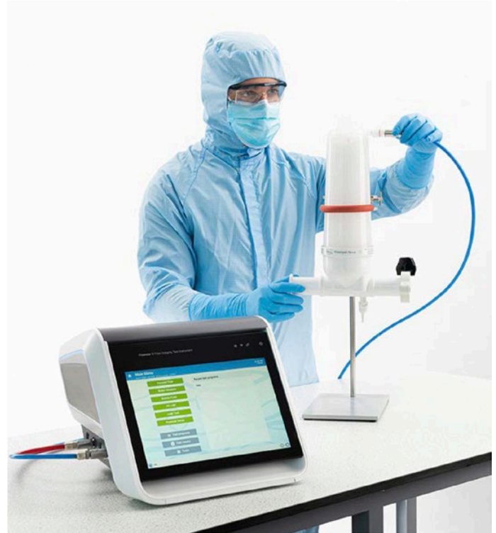
Fig 2. Integrity testing a filter capsule.

Finally, with the different data backup possibilities, including manual and automatic backup options, and the expanded data storage capacity on the instrument, the Palltronic Flowstar V integrity test instrument ensures compliance with all data backup, retention and retrieval requirements.