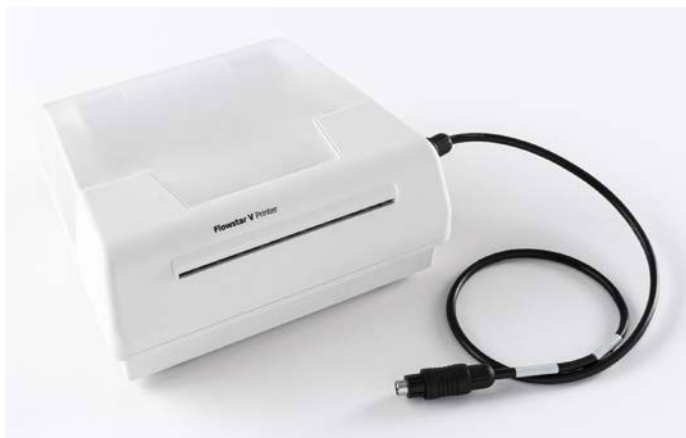
Fig 6. Thermal printer as delivered.

The printer can be used on a table next to the Palltronic Flowstar V instrument or be set in the indentation on the top of the Palltronic Flowstar V instrument.